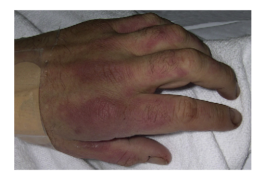
Fig 6. Acral erythema from docetaxel.

Acral erythema, or hand—foot syndrome, is a common and well documented side effect of docetaxel therapy.<sup>155-159</sup> In fact, docetaxel, along with cytarabine, doxorubicin, liposomal doxorubicin, and 5-fluorouracil, is most frequently associated with the condition.<sup>160</sup> Clinically, there are discrete erythematous or violaceous patches or edematous plaques that arise on the palms and soles and may progress to involve the dorsal surfaces of the hands (Fig 6) and feet. The eruption may be more extensive with truncal involvement. Plaques may be asymptomatic,