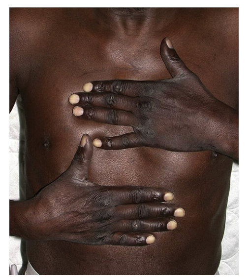
Fig 8. Hyperpigmentation of the dorsal surface of the hands from capecitabine.

the use of systemic fluorouracil, but had never before been linked to capecitabine therapy.<sup>217</sup>