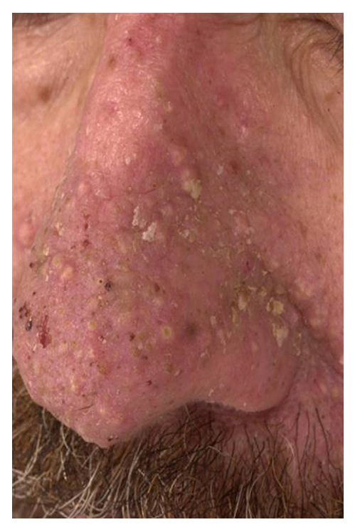
Fig 1. Severe pyoderma faciale—like eruption from erlotinib.