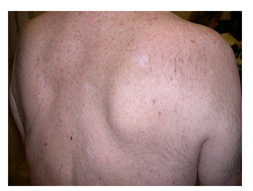
Fig 2. Mild follicular eruption and xerosis from gefitinib.

gefitinib,<sup>6,7</sup> 48% to 67% in patients on erlotinib,<sup>8,9</sup> and 75% to 91% in patients receiving cetuximab.<sup>10-12</sup> A dose-dependent relationship between both incidence and severity of the eruption was further observed in these early trials.<sup>13</sup> Numerous studies have since documented the characteristics of the eruption more fully.<sup>5,14-20</sup> The median time after initiation of treatment to onset of the eruption is 7 to 10 days,<sup>18</sup> and maximum severity is reached in the second week.<sup>21</sup> Most cases resolve without scarring after completion of therapy, but partial or complete resolution may be seen despite continued therapy.<sup>3,15,21</sup>