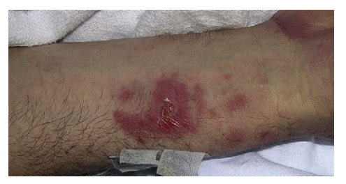
Fig 7. Fixed erythrodysesthesia plaque from docetaxel.

Histopathologic findings are similar to those seen in acral erythema.