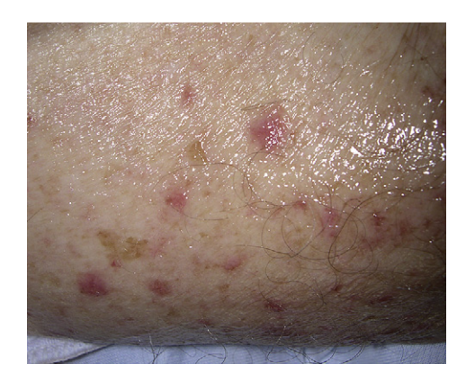
Fig 9. Inflammation of actinic keratoses from capecitabine.

One case of Mucha–Habermann syndrome in a patient receiving tegafur is also reported. A 59-yearold male noticed a papulonecrotic eruption on his trunk and extremities after approximately 200 days of daily tegafur use. Histology revealed "epidermal necrosis surrounded by spongiosis, perivascular inflammatory infiltrations composed of lymphocytes and erythrocytes, and endothelial swelling."<sup>230</sup>